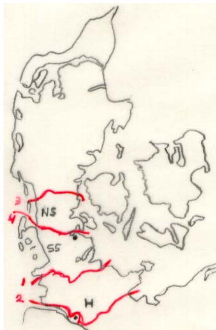
DANMARK – DENMARK.

NS = Nordslesvig SS = Sydslesvig or Südschleswig. H = Holstein.