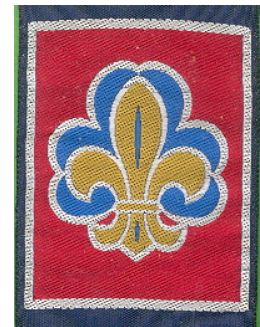
Right. Badge and emblem of Det Dansk Spejderkorps Sydslesvig (DDSS) (7 x 5 cm).