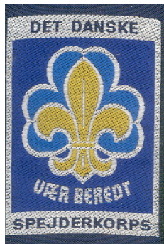
Left. Badge and emblem of Det Danske Spejderkorps (7½ x 5 cm).