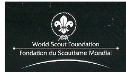
The WSF emblem.

Princess Ingrid (1910-2000), Prince Gustaf Adolf's sister and the present King's aunt, joined Swedish Guiding. (See ROYAL SCOUTS -5-, Denmark. )